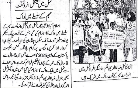
نہل میں پیشکش ازولمنٹ مہم کے سلسلے میں واک کا اہتمام