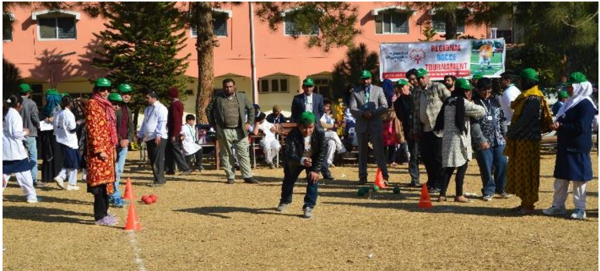
Joint games with Special Olympics