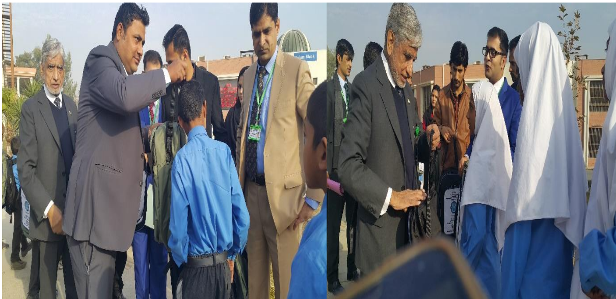
Bags Distribution Ceremony by the Department of Governance and Public Policy