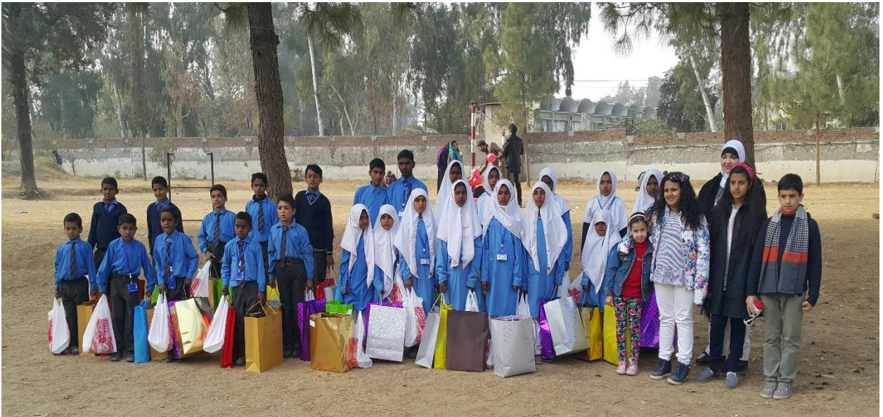
A group photo with Palestine's Diplomat and the Principal of Sheikh Zaid International Academy

The wife of Palestine's Diplomat and the Principal of Sheikh Zaid International Academy visited NUML with her son and daughters to confer their heart by giving them stationery, water bottles, warm coats, Lunch and promise to help them in future.