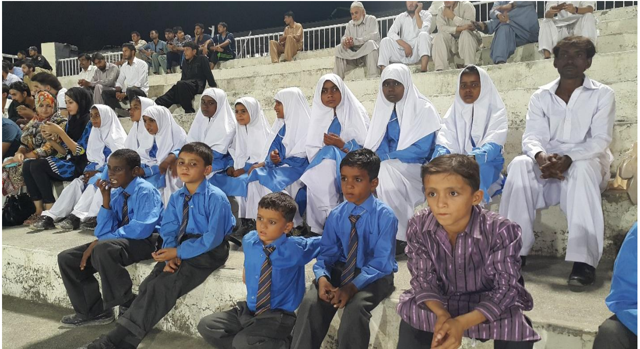
Visit to Rawalpindi Cricket Stadium

National University of Modern Language Islamabad arranged many events for their better learning time to time. The detail is as under