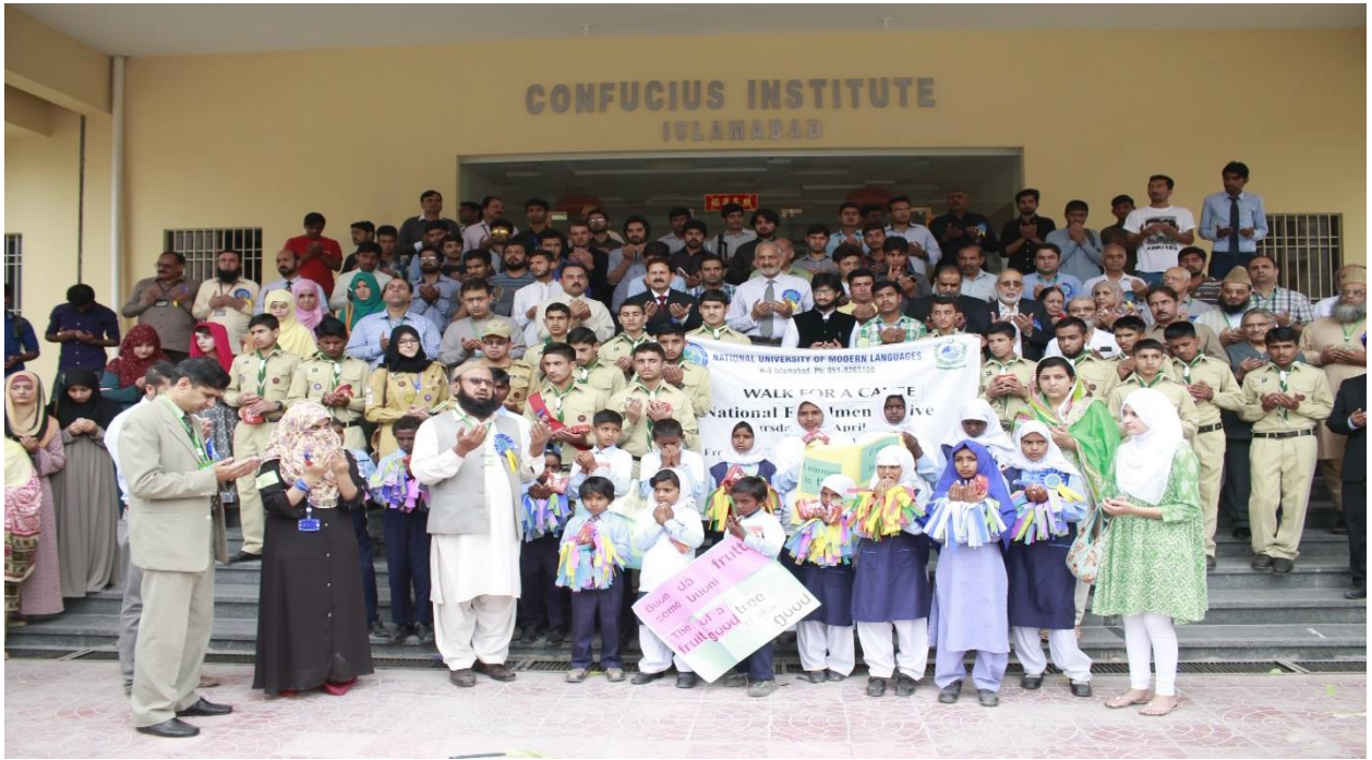
A walk for a Cause (for Education)