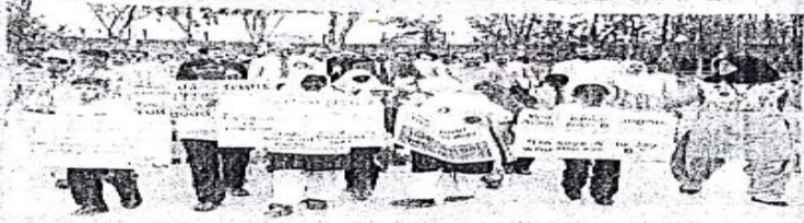
STUDENTS participate in a walk to encourage out-of-school children to re-enroll.