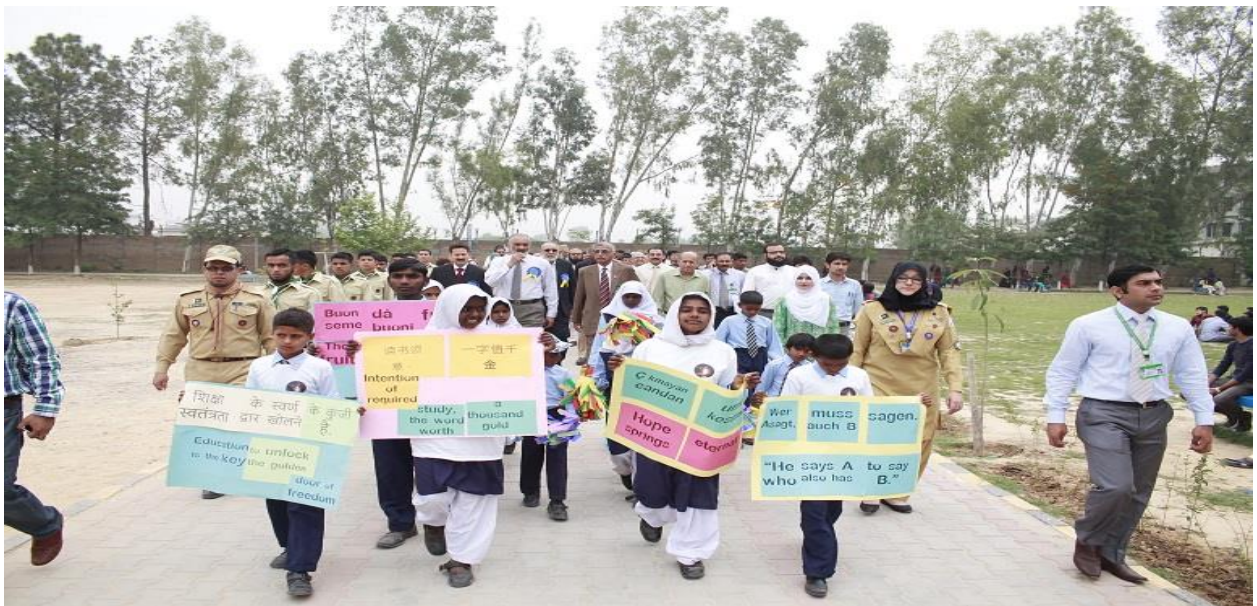
A walk for a Cause (for Education)