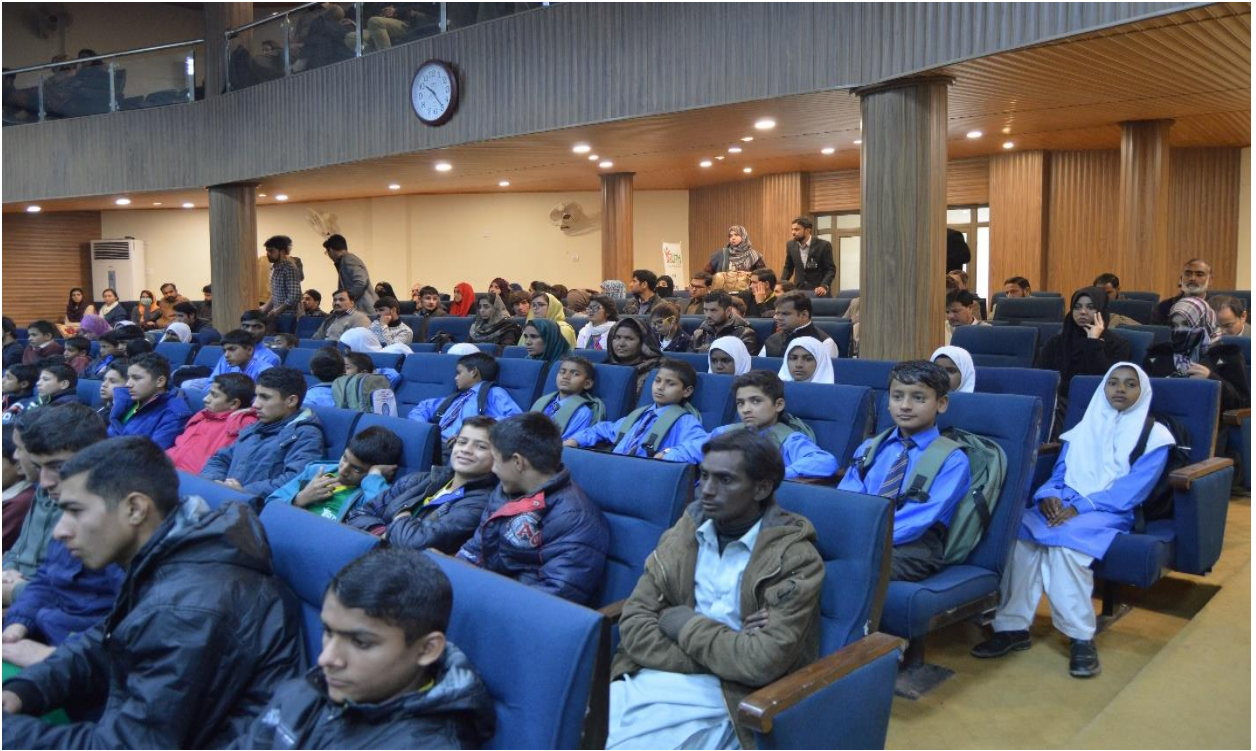
Attending a Seminar on APS Shohada in the NUML Auditorium